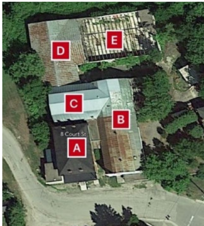
Proposed Asphalt Detail

Red boxes B, C, D AND E identify the former Syrup Factory to be demolished.