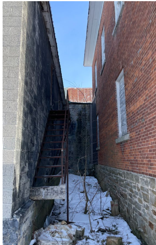
Link at side of Factory to Old Town Hall