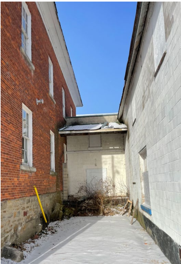
Link at front of Factory to Old Town Hall