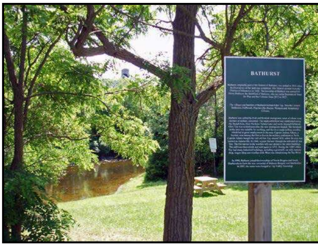
Bathurst Plaque Tay River and historic Glen Tay Mill in background