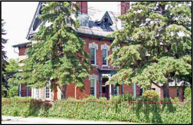
The J.T. Gallagher House (c1885), one of many stately heritage homes in Newboro

Km. 25.3 (44° 44.366'N. 76° 30.030'W.) Turn Right (Easterly) onto Country Road 6 also called Althorpe Rd. - Christie Lake Rd. toward Glen Tay. Many hills, flats and corners. Cottage Roads to Farren Lake to the south and Christie Lake to the north. Cross over the Tay River. You will see this scenic and historic River again. Pass through DeWitt's Corners and near a large modern mineral processing factory reflecting the rich and varied mineral wealth of the Shield and Axis, past and present.